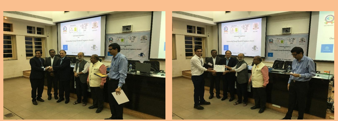
Prize Distribution to Working officials Category