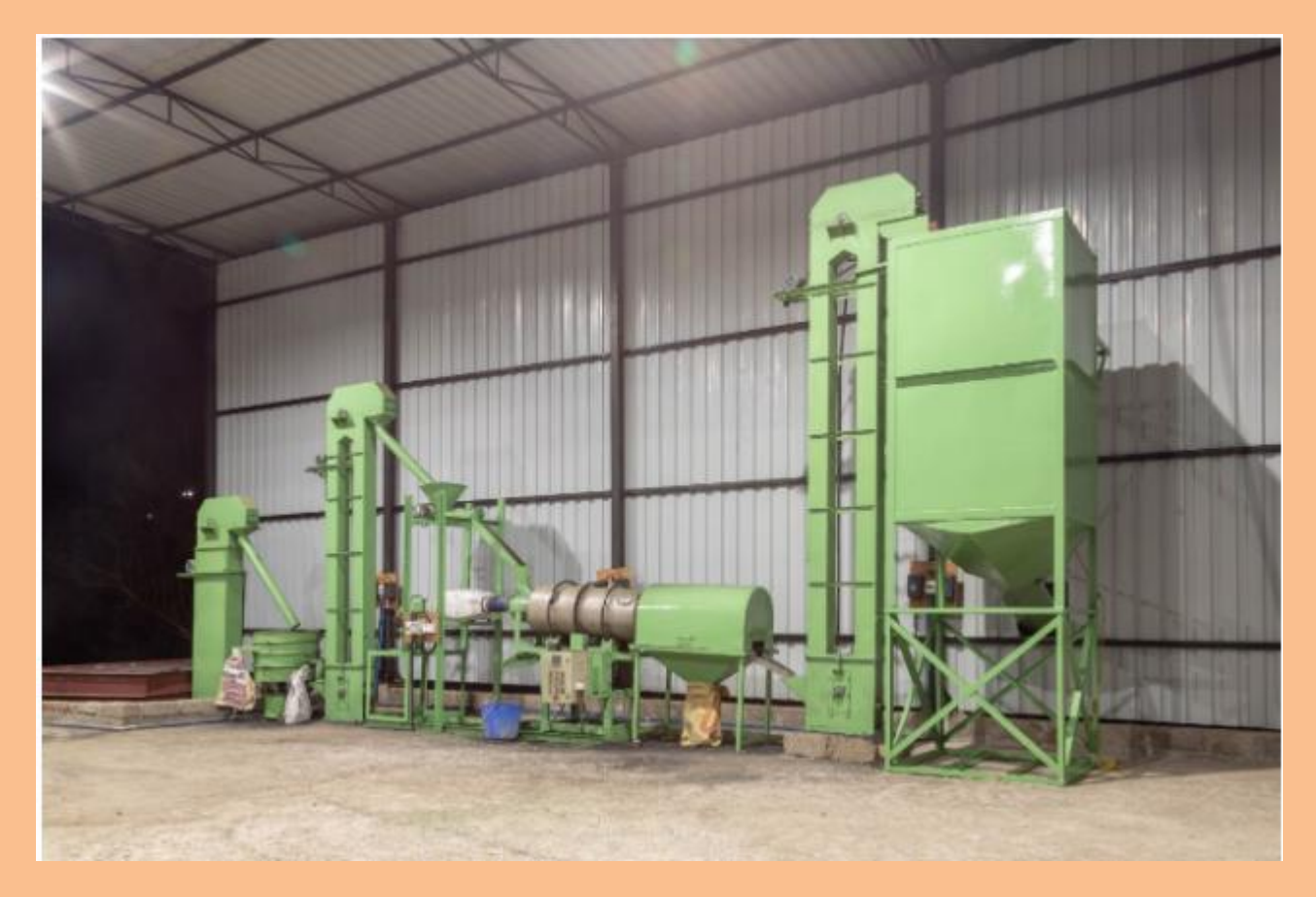
Fig.1. Sand reclamation plant, commissioned at Govt. Polytechnic, Kolhapur

the properties of reclaimed san are satisfactory and meet the quality standards after several tests in their in-house lab. A total of more than 2,500 castings have been made by this reclaimed sand, and the quality of these castings is found to be excellent. This one-month trial helps us to disseminate this technology widely and lay the foundation for its go-to-market strategy. The two-stage attrition device represents a breakthrough technology that would appreciably reduce the issue of waste sand disposal. Also, it would cater to the needs of the foundries by making them partially or fully independent of sand mining. It is a holistic approach towards establishing zero-waste foundries, thereby working towards an eco-friendly and greener society. We are also working on chemical reclamation approach to convert waste green sand to core sand which would fetch more profit.